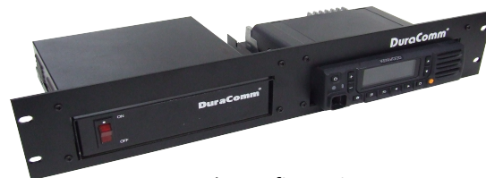
Sample configuration Power supply and radio not included