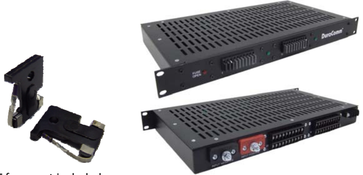
*GMT fuses not included